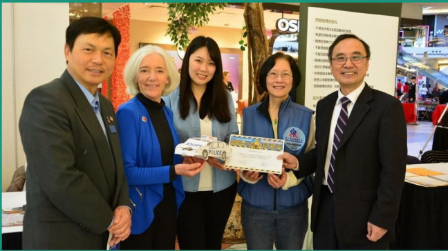
May 6th - CCMC 6th Annual Safety & Secure Living Fair 5月6日第六屆中信中心安全博覽會

On June 18th, our volunteers participated in the 3rd annual Vancouver CPC soccer tournament. 6月18日，我們的志願者們參加了第三屆溫哥華警訊服務中心年度足球錦標賽。