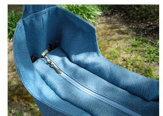
Bag with a zipper to prevent thief from reaching into your bag